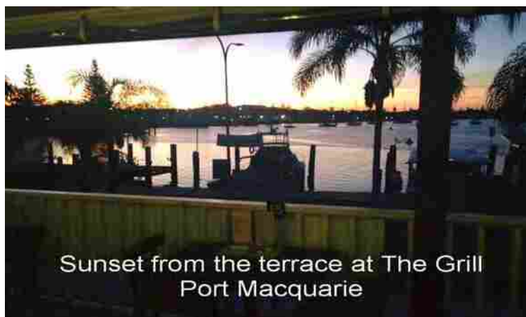
Sunset from the terrace at The Grill Port Macquarie